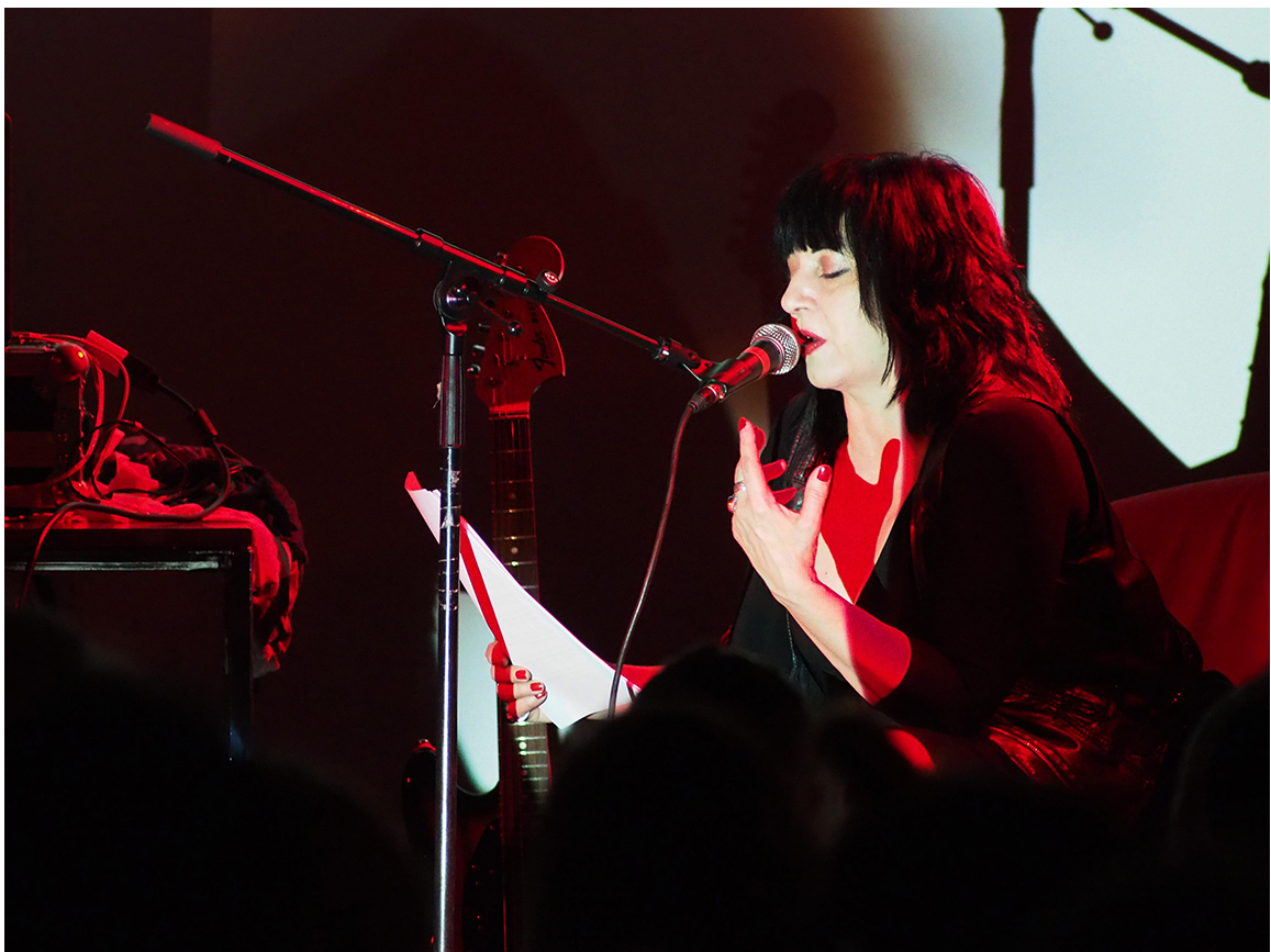
Lydia Lunch

Lydia Lunch lives in New York and is an artist who defies definition. She has performed internationally as a singer, spoken word performer and musician since 1977. Dust & Shadows is a brutal, tragic, humorous, poetic performance that inimitably combines questions of mortality and a fear of death with political power, war and environmental disasters as well as love, hope and transformation. Her appearance in the Villa for Forest as part of Slow Light-Seeking Darkness is her first performance in Carinthia.